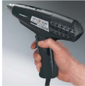
Optimised weight balance ensures fatigue-free long term operation