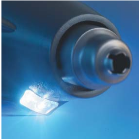
LED light provides bright illumination of the work area and also serves as a convenient "on" indicator