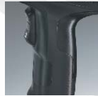
The ergonomically shaped soft grip handle ensures comfortable handling