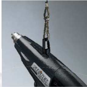
Integral security hanger for safety and convenience