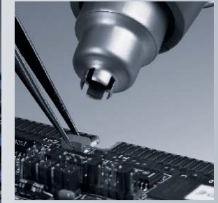
Ideal for de-soldering electronic components

Targeted illumination for enhanced precision