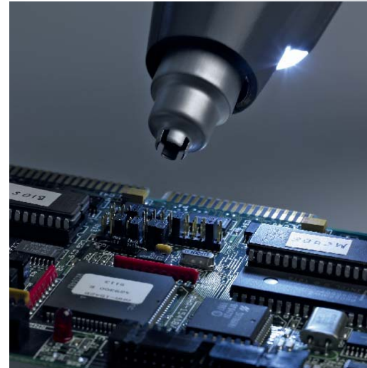
Integrated LED light

Targeted illumination for enhanced precision