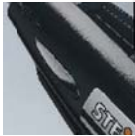
Molded safety rests