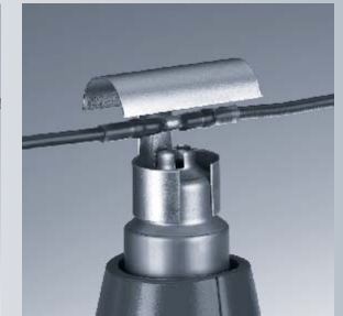
Variety of reflectors available for specific shrink tube and solder sleeve applications